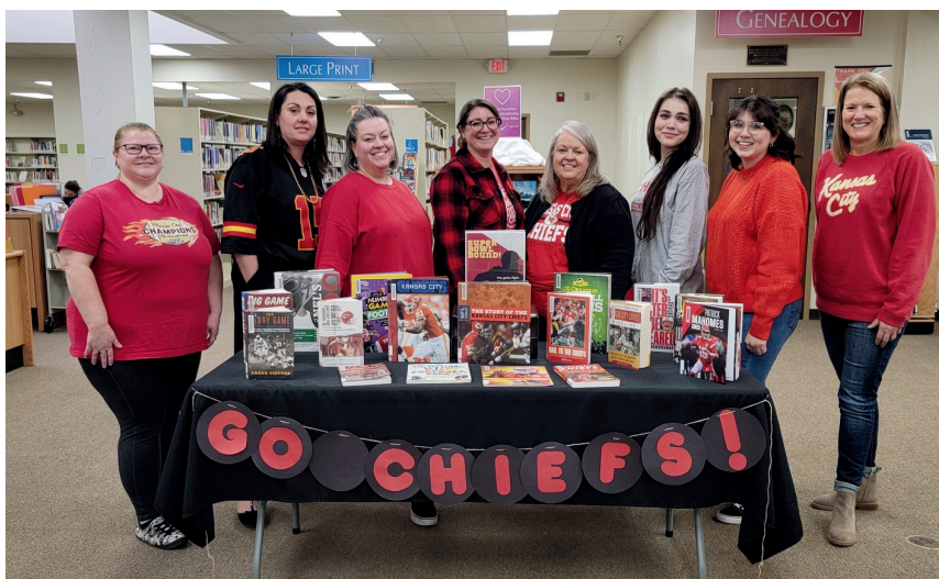
Throwback photo of the Harrisonville Branch staff supporting the Kansas City Chiefs!